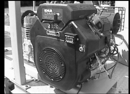
20 HP Kohler Command Engine with tachometer and hour meter